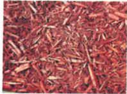
Orange-Gold Mulch (Spanish Gold)