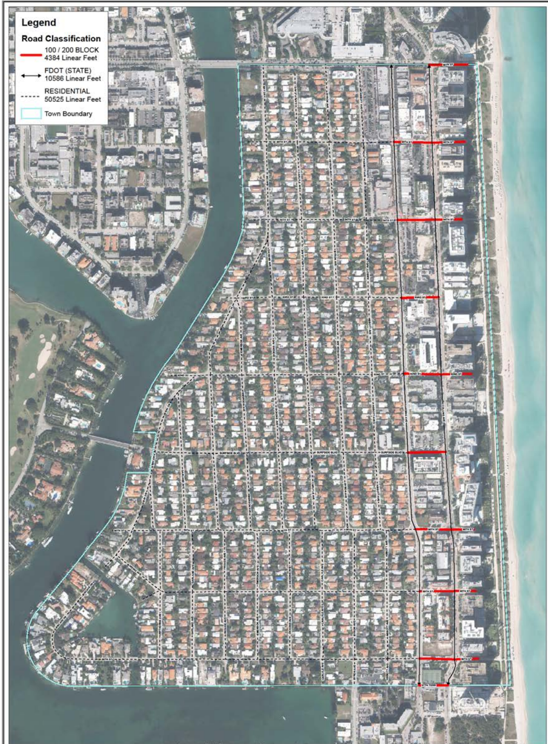
Exhibit "A" Town Streets and Avenues Map