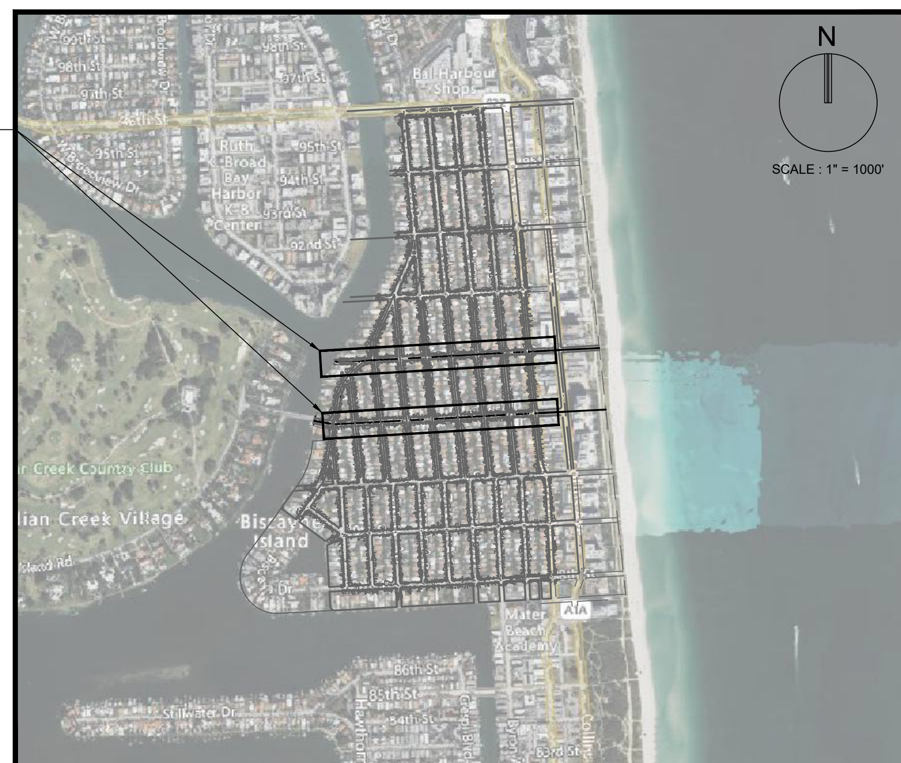
LOCATION MAP SECTION 35, TOWNSHIP 52 S, RANGE 42 E