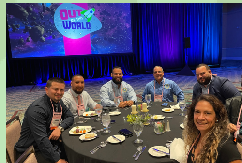
Surfside's Parks and Rec. Team at the FRPA Annual Conference

The Town of Surfside Parks and Recreation administrative staff recently embarked on a journey of professional growth at the annual Florida Recreation and Park Association (FRPA) educational conference. This conference has become the ultimate hub for park and recreation professionals across the Sunshine State. The event's allure lies in its diverse and enriching program, featuring an array of workshops and sessions meticulously designed to elevate the skill set of every participant. From aquatics to park administration, athletics to childcare, programming to park maintenance, the conference assembled an impressive lineup of presenters who shared their expertise and insights. Surfside's team returned home not only rejuvenated but also armed with fresh ideas and renewed motivation to make the community's parks and recreational spaces even more vibrant and inviting.