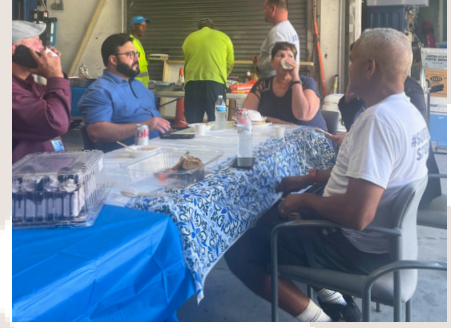
The Public Works department hosted an appreciation barbecue on Nov. 22, acknowledging the efforts and contributions of its team members.