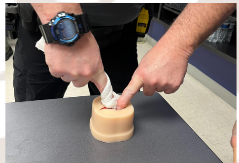
Surfside police officers recently attended a Stop the Bleed training, focusing on wound packing and tourniquet application. The session equipped them with essential skills to address traumatic injuries and control bleeding effectively. This initiative underscores the commitment of Surfside's law enforcement to enhance their capabilities in emergency medical response, further ensuring the safety and well-being of the community. The hands-on training provided valuable insights and practical knowledge, empowering officers to act swiftly and decisively in critical situations.