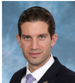
MAYOR Shlomo Danzinger