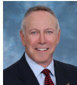
COMMISSIONER Fred Landsman