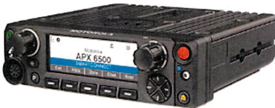
E5 Control Head

Multiple hardware encryption algorithms secure your voice and data while two-factor authentication ensures only valid radio users can access your system and critical databases.