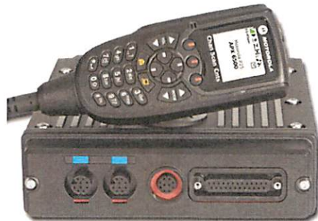
O3 Control Head