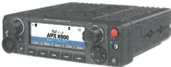
E5 Control Head

Multiple hardware encryption algorithms secure your voice and data while two-factor authentication ensures only valid radio users can access your system and critical databases.