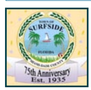
9293 Harding Avenue Surfside, Florida 33154

ADVERTISING IN THE GAZETTE - Reach the residents and businesses of Surfside by advertising in the monthly Gazette. For rates, deadlines and more information, dhunziker@townofsurfsidefl.gov.