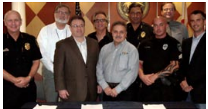
Representatives from the Fraternal Order of Police and Town officials recently completed negotiations and signed a new labor contract.

Surtside 3rd THURSDAYS Enjoy the Music and Festivities ON HARDING AVENUE A1A Southbound from 96th to 94th Streets 4-97M