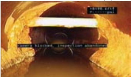
Inspection camera shows a pipe section that is blocked and damaged.

are cracked, broken or blocked by roots and vegetation. These leaks and blockages affect the systems overall performance and require constant maintenance.