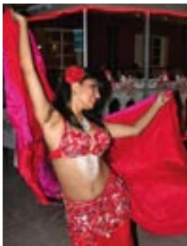
Surfside Spice 2011 kicked-off with a popular Culinary Passport to the World on Harding Avenue. Restaurants offered delicious samples of their specialties, while musicians and dancers entertained the crowd.