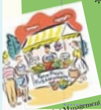
The Green Market Management