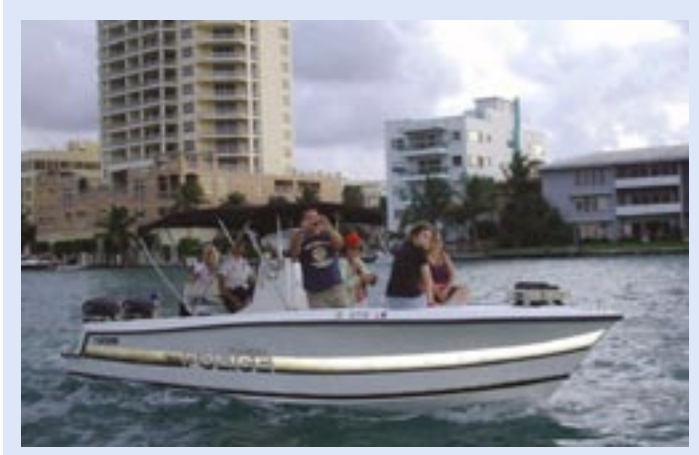
Members of Surfside's 10th Citizens Police Academy took a tour of the Intracoastal Waterway for the Marine Patrol class with the assistance of Bal Harbour Police Department, Miami Beach Police Department and Indian Creek Public Safety Department.