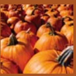
FALL HARVEST FEST Sunday, November 20 1:30-3:30 p.m. 96th Street Park