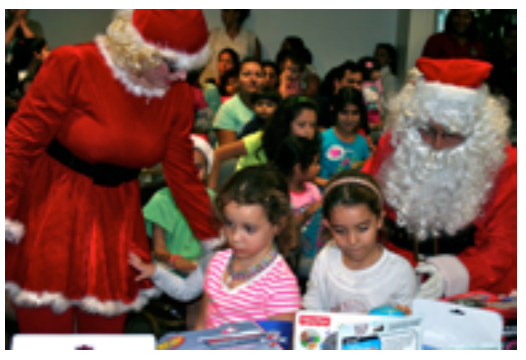
December 18, 2014.

The Surfside Police Department is collecting toys this holiday season for our sixth Annual Holiday Toy Drive. Please show your support by bringing new unwrapped toys for children ages 1-13 to the Surfside Police Station located at 9293 Harding Ave. The last day to donate is Thursday,