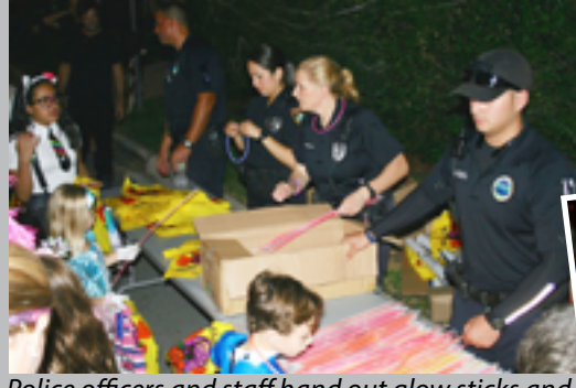
Police officers and staff hand out glow sticks and candy bags to trick or treaters.

The Halloween Block Party sponsored by the Surfside Police Department has become a Town tradition with thousands gathering in the residential neighborhood to compare costumes, socialize and pick-up goodies for the children.