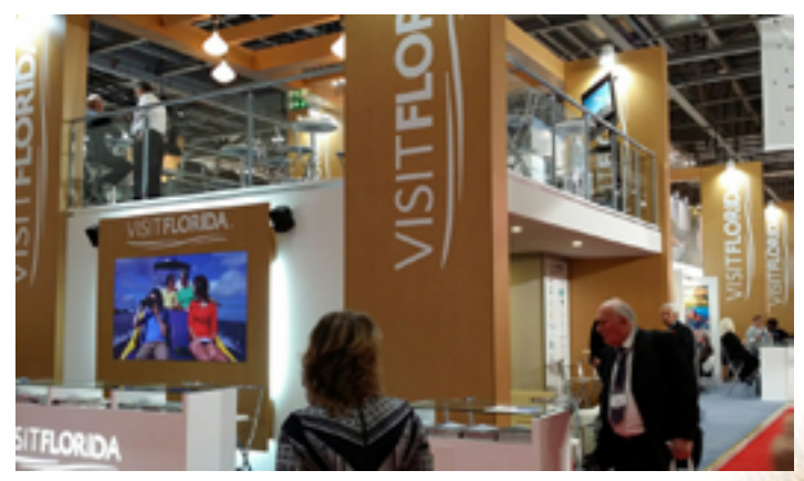
Visit Florida display at an international tourism convention.

It is important for Surfside to compete on the global tourism stage and reach out directly to our target markets. For example, Bal Harbour allocates approximately $660k for such endeavors. Supporting our partners like GBHS, as well as future hotel properties, will help to increase the resort tax revenue that benefits the residents of Surfside.