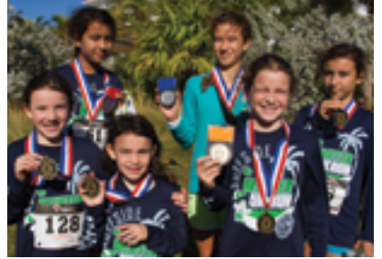
Above are members of the boys and girls "Little Runners" showing off their medals after finishing the 5K. The group trained for the event as part of a Parks & Recreation program.