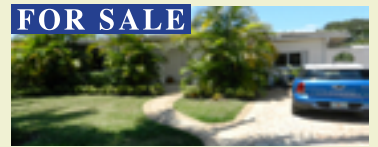
9208 Byron Ave. Offered at $689,000

We Have Sold More Homes In Surfside Than Any Other Realtor!