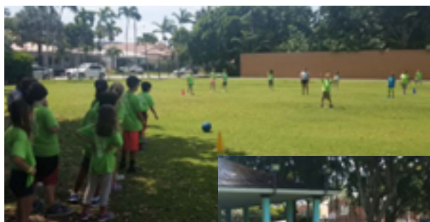
An exciting kick ball game at the 96th Street Park for the Green Team, ages 9-12 years.