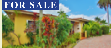
724 90th St. Offered at $1,450,000