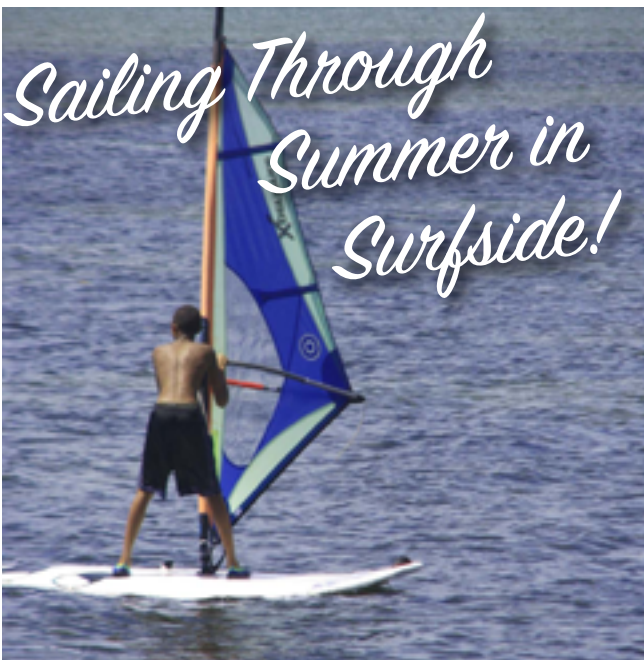
Teen Summer Campers go sailboarding at the beach.