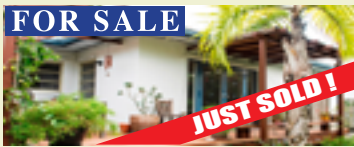
8950 Carlyle Ave. Offered at $639,000