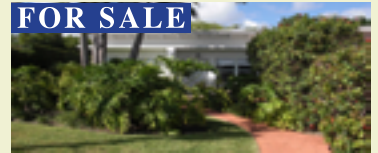
8910 Garland Ave. Offered at $769,000