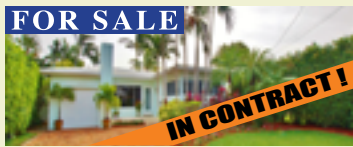
8943 Carlyle Ave. Offered at $729,000