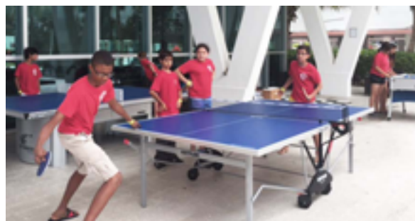
Summer staff welcomes attendees to the start of camps. At left, ping-pong and foosball on the pool deck and at bottom, Blue Team practices yoga.