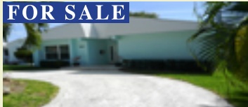
9009 Hawthorne Ave. Offered at $795,000