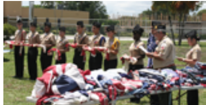
Flag Day ceremony to destroy unusable American flags.