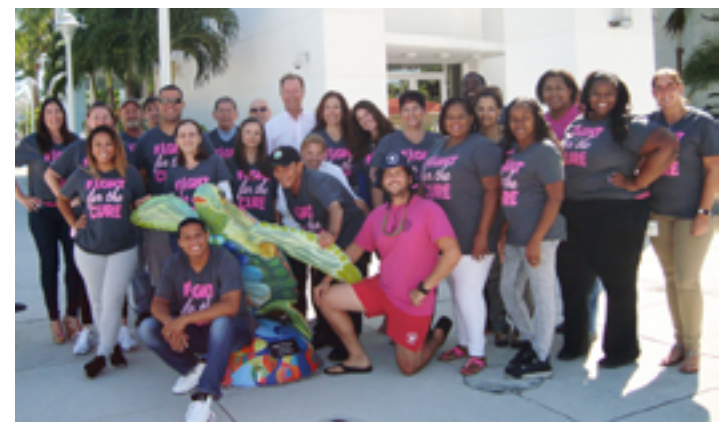
NOVEMBER 2016 SURFSIDE GAZETTE