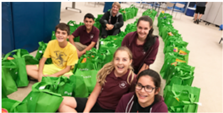
Teen Scene members stuffed more than 150 bags for the Parks and Recreation 11th annual 5K Race. To become a teen scene member, contact the Community Center.