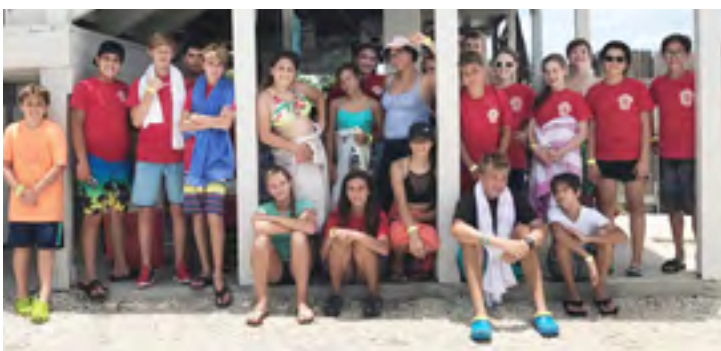
Above, Teen Camp ages 12-15yrs enjoy a day of kayaking at Oleta State Park. At left, the Blue Team ages 6-8 snap a photo outside Funderdome during a field trip.