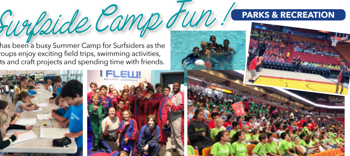
Surfside campers in green shirts and Teen campers in red shirts enjoy Burnie's Summer Bash at American Airlines Arena.