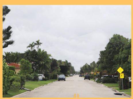
An altered photo (right) shows how a Surfside block would look after utilities undergrounding and poles and overhead wires removed.