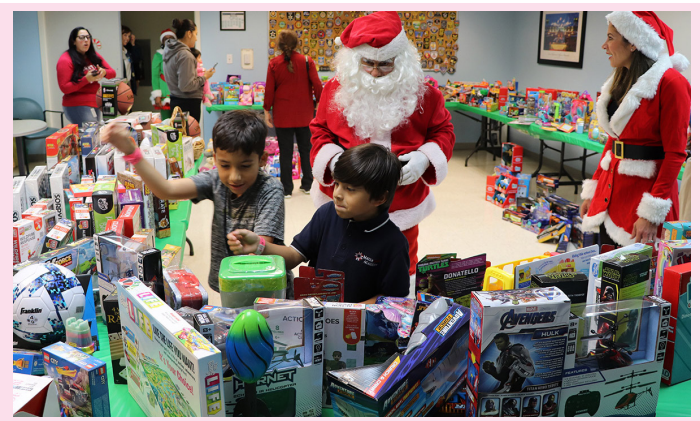
Last year's toy give-away event for children at Town Hall.