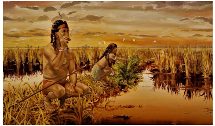
Smoke in the Wind, Theodore Morris