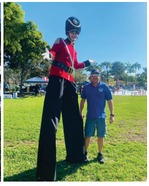
December was a month filled with holiday cheer, arts & crafts, snow and music, as the Parks and Recreation Department hosted the annual Winter Wonderland celebration!